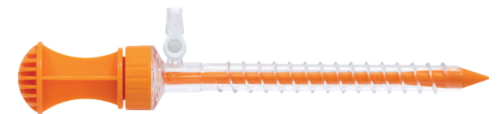
Cannula 8.5 mm x 110 mm (741940000) Threaded cannula with obturator measuring 8.5 x 110 mm.