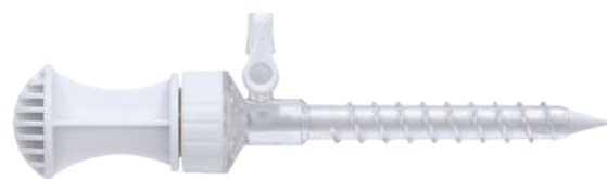
Cannula 6.5 mm x 70 mm (740040000) Threaded cannula with obturator measuring 6.5 x 70 mm.