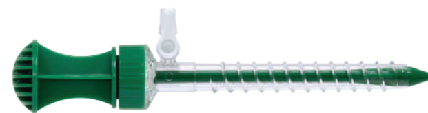
Cannula 8.5 mm x 90 mm (740050000) Threaded cannula with obturator measuring 8.5 x 90 mm.