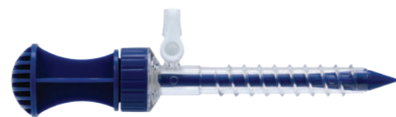
Cannula 8.5 mm x 70 mm (740120000) Threaded cannula with obturator measuring 8.5 x 70 mm.