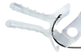
FP Hook + FP Hook Inserter